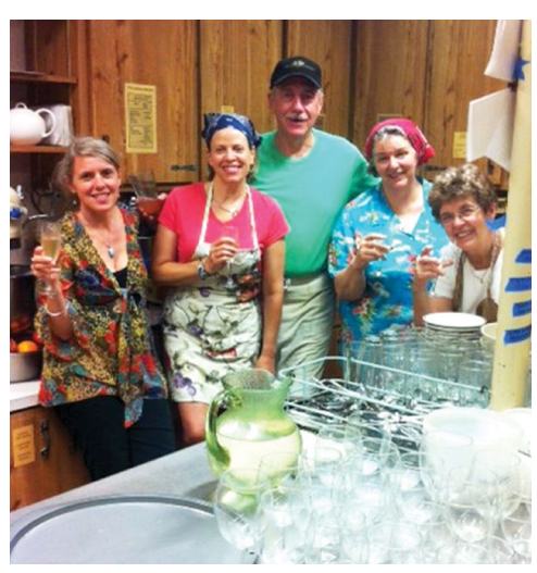
Resident community and volunteers in the kitchen with a pile of dishes!

This will be one of the largest remodeling projects since the founding days of ARC. We will need the financial help of everyone. Donations, as of October 2014, have surpassed the half-way mark toward our $60,000 goal.