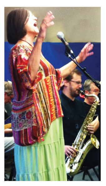
Jazz as a metaphor for the spiritual life. A special Summer Soul Day in the City at Peace UMC in Shoreview, MN with Jumpin' Jehosafats jazz band.

One day can make a big difference. This new one-day retreat offers good food, deep conversation, and spiritual practice. Retreatants at our first Soul Days this past summer experienced a much needed time of renewal.