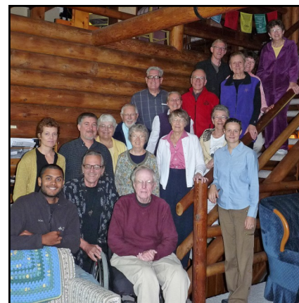
Friends of ARC Retreatants, August and September 2010.