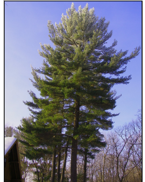
ARC's majestic white pines.