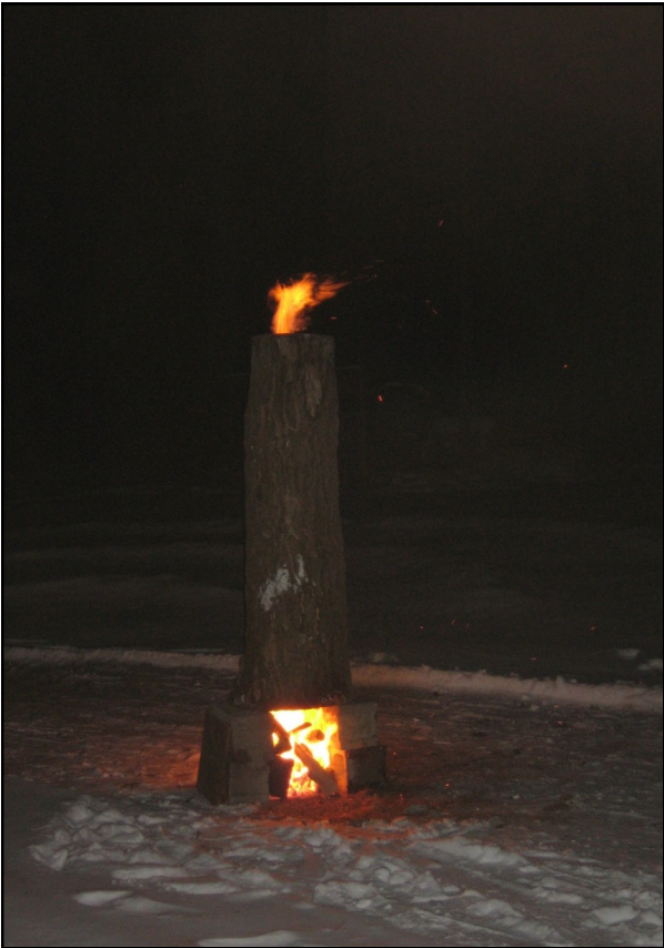
ARC Solstice Celebration: From Darkness to Light