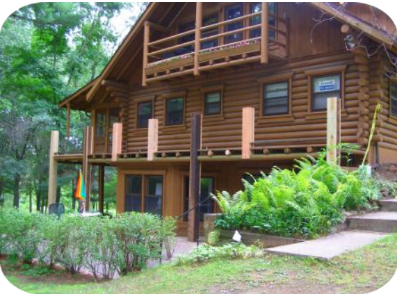
Balcony work in process, above. Below, the project completed.