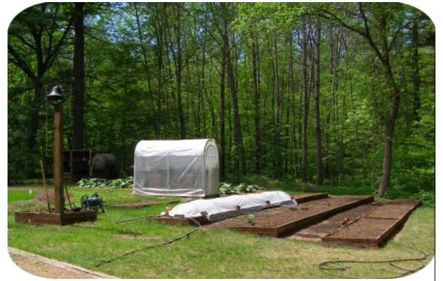
New garden beds. Bob Hoxie busy planting Spring, 2009.