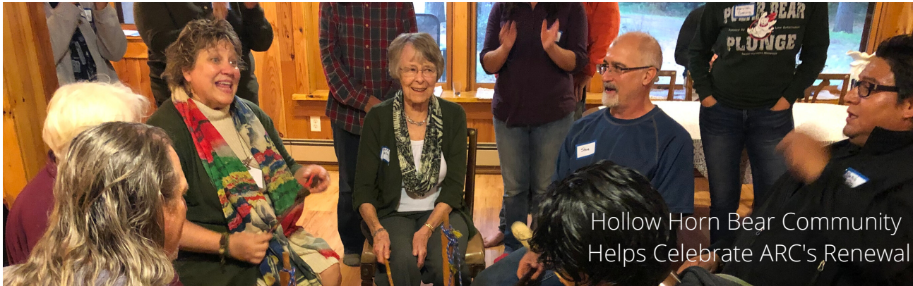
Hollow Horn Bear Community Helps Celebrate ARC's Renewal

THE OFFICIAL ARC RETREAT COMMUNITY NEWSLETTER