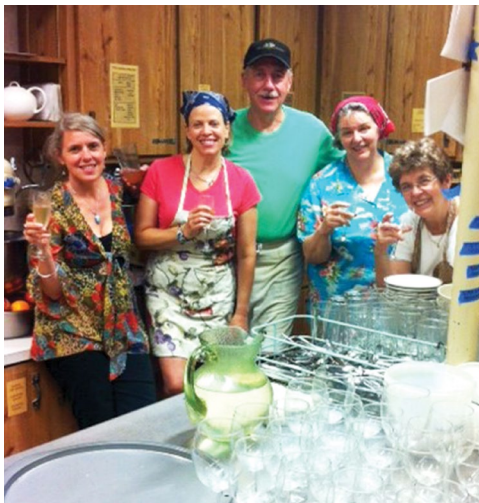
Resident community and volunteers in the kitchen with a pile of dishes!

We invite you to become an "ARC Builder" and ensure quality facilities for this integral part of ARC's mission. To receive a pledge sheet go to www.ARCretreat.org/NewKitchen or contact the ARC office: 763-689-3540 or ARCretreat@hotmail.com .